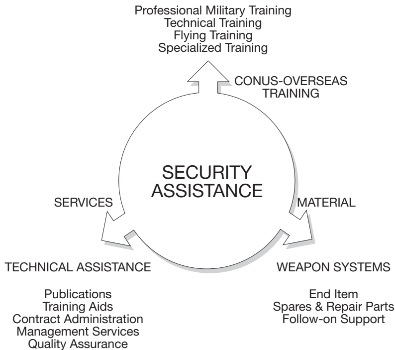
Figure 14-2 Total Package Approach

Planning and programming follow-on training support is an extremely important part of a viable training program. Those personnel involved in managing FMS programs should re-evaluate training requirements any time the procurement plan changes and coordinate training requirements in advance.